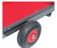
Set of air wheels