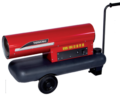
TA 22 / 30